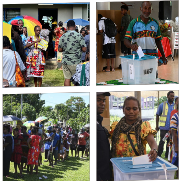
PC: AP News & RNZ on Vanuatu Snap Election 2025.

In regard to Snap Election, public servants must submit their resignation two (2) weeks before polling day.